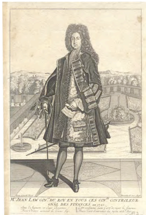
John Law Plate from Het Grootte Tafereel

337. [Het Grootte Tafereel]. Plate 2, depicting John Law, from Het grootte tafereel der dwaasheid. Vertoonende de opkomst, voortgang en ondergang der actie, bubble en windnegotie, in Vrankryk, Engeland, en de Nederlanden, gepleegt in den jaare MDCCXX . (Prob. Amsterdam: publisher uncertain, c. 1720.) Folio [34.5 by 22 cm], engraved copperplate [signed "Leon:Schenk Fecit / Pet:Schenk Exc:Amst"] printed on one side of unwatermarked laid paper. Text below in French. Slight toning and other minor signs of aging; darker near spine where detached from original volume. Near fine. $350