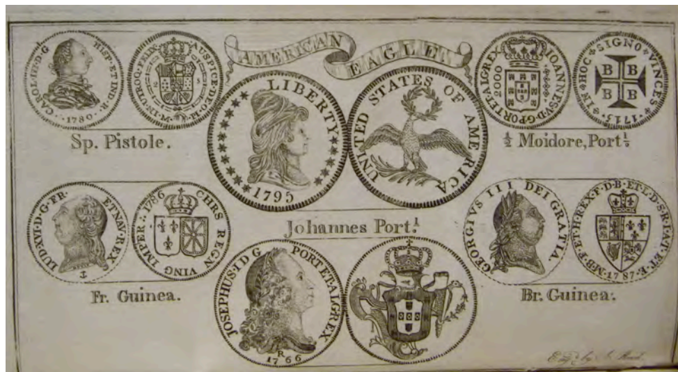
First Known Appearance of the Dollar Sign in Print, and Earliest Known Illustration of a U.S. Coin

500. Lee, Chauncey. The American Accomptant; Being a Plain, Practical and Systematic Compendium of Federal Arithmetic; in Three Parts: Designed for the Use of Schools, and Specially Calculated for the Commercial Meridian of the United States of America. Lansingburgh: Printed by William W. Wands, 1797. 12mo., modern green calf, sides panelled in blind, spine lettered and dated in gilt with four raised bands. Frontispiece engraving of coins in current usage in the U.S. by A. Reed; 297, (15) pages. Later pages with marginal staining to thumb, not affecting legibility. Professional tissue repair to frontispiece. Very good. $1750